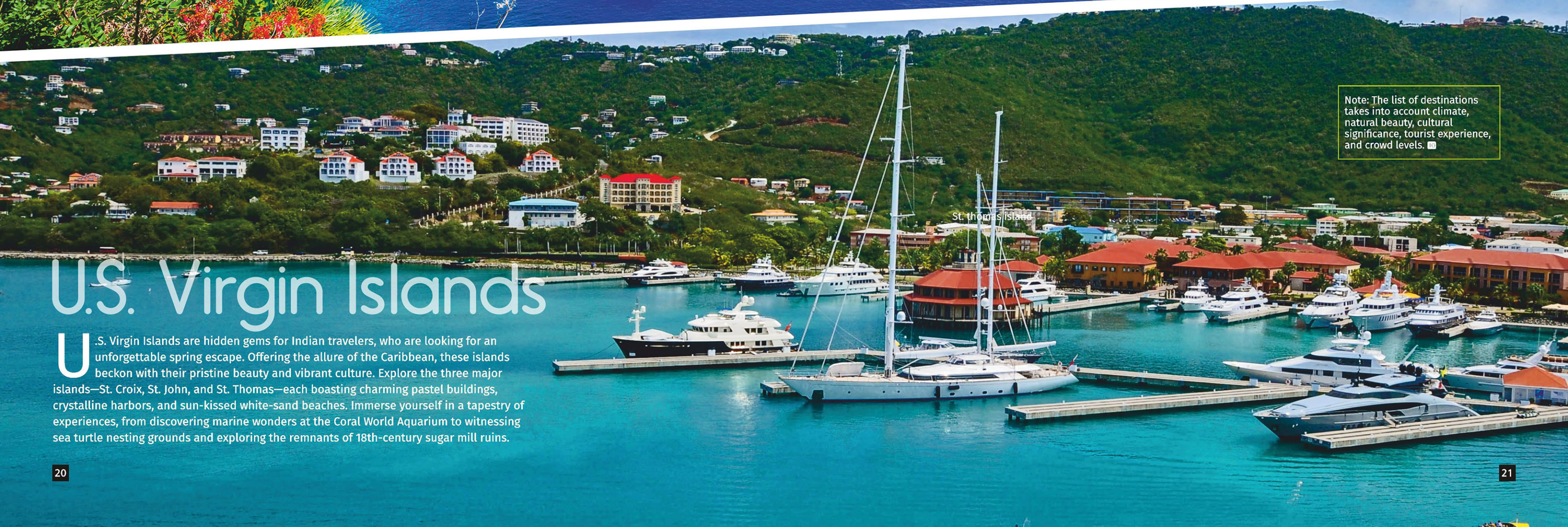
St. Thomas Island

Springtime in Naples beckons with mild weather, blooming flowers, and culinary delights. Immerse yourself in the city's authentic charm, from street art to family-run workshops. Wander through historic sites, savour traditional pizzas, and soak up the vibrant atmosphere along the seafront promenade, Lungomare. Visit in April for a pleasant experience before the summer heat sets in.