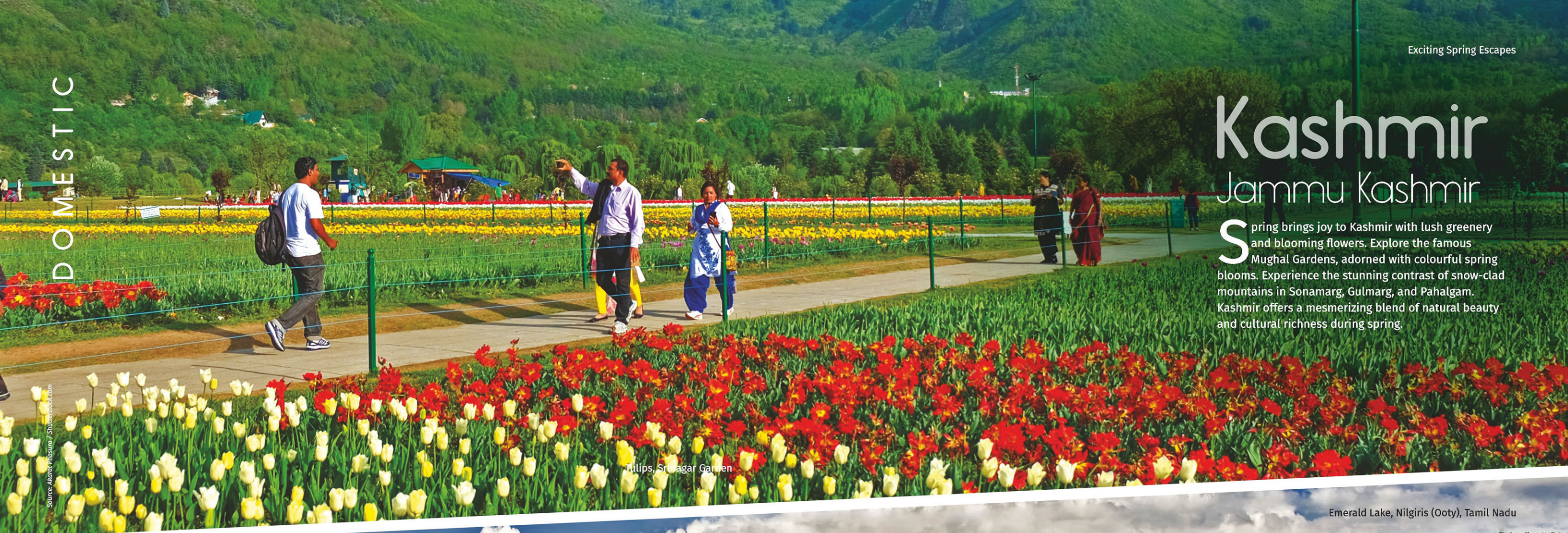
Tulips, Srinagar Garden

Spring brings joy to Kashmir with lush greenery and blooming flowers. Explore the famous Mughal Gardens, adorned with colourful spring blooms. Experience the stunning contrast of snow-clad mountains in Sonamarg, Gulmarg, and Pahalgam. Kashmir offers a mesmerizing blend of natural beauty and cultural richness during spring.