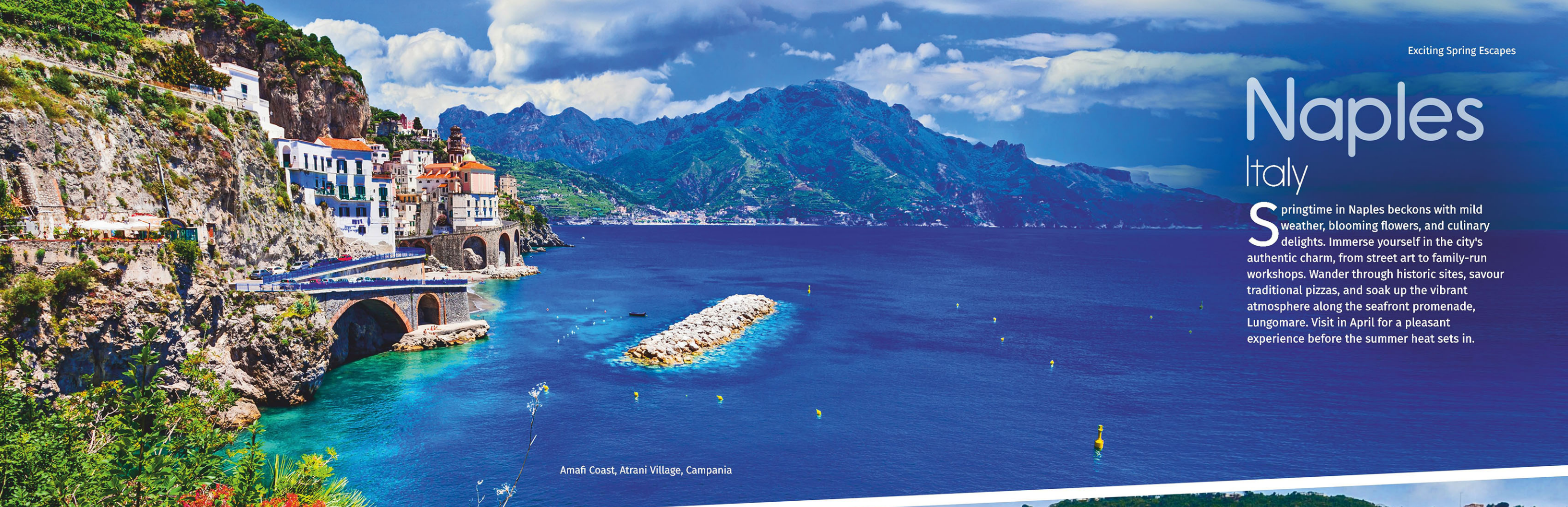
Amalfi Coast, Atrani Village, Campania