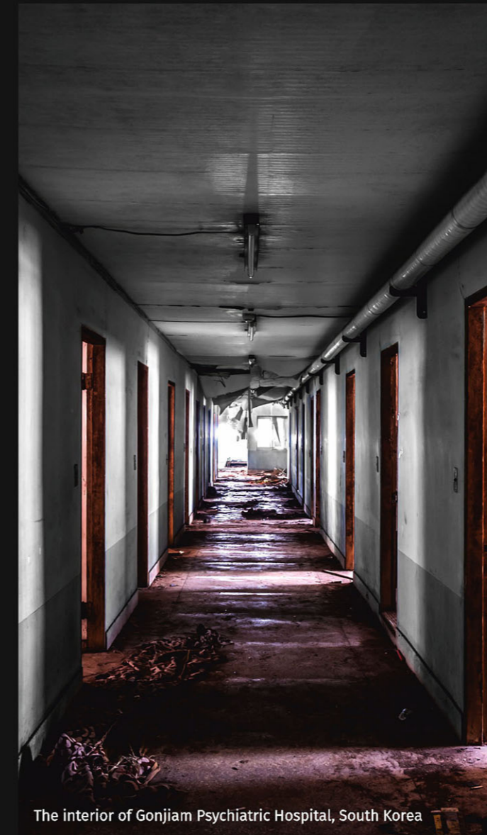
The interior of Gonjiam Psychiatric Hospital, South Korea