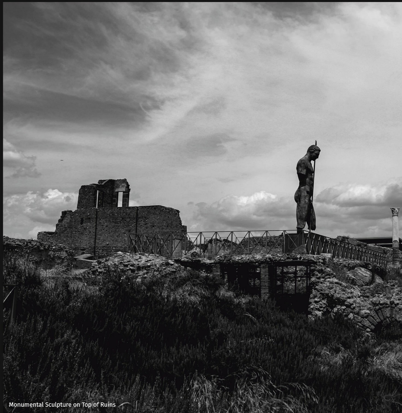
Monumental Sculpture on Top of Ruins