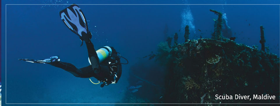
Scuba Diver, Maldives

Ultimately, deep sea tourism represents a profound shift in how we connect with our blue planet. No longer confined to the surface, these innovative experiences beckon us to take the plunge and engage directly with the wonders and fragility of the marine world. By unleashing a sense of childlike amazement at the undersea mysteries unveiled, deep ocean tourism kindles a sacred responsibility within us all to safeguard the ocean's splendours. As we pursue these extraordinary voyages, may the beauty we witness transform us into impassioned advocates for the seas. For, only by protecting these hidden realms can generations to come continue unveiling the ocean's timeless grandeur. 🌊