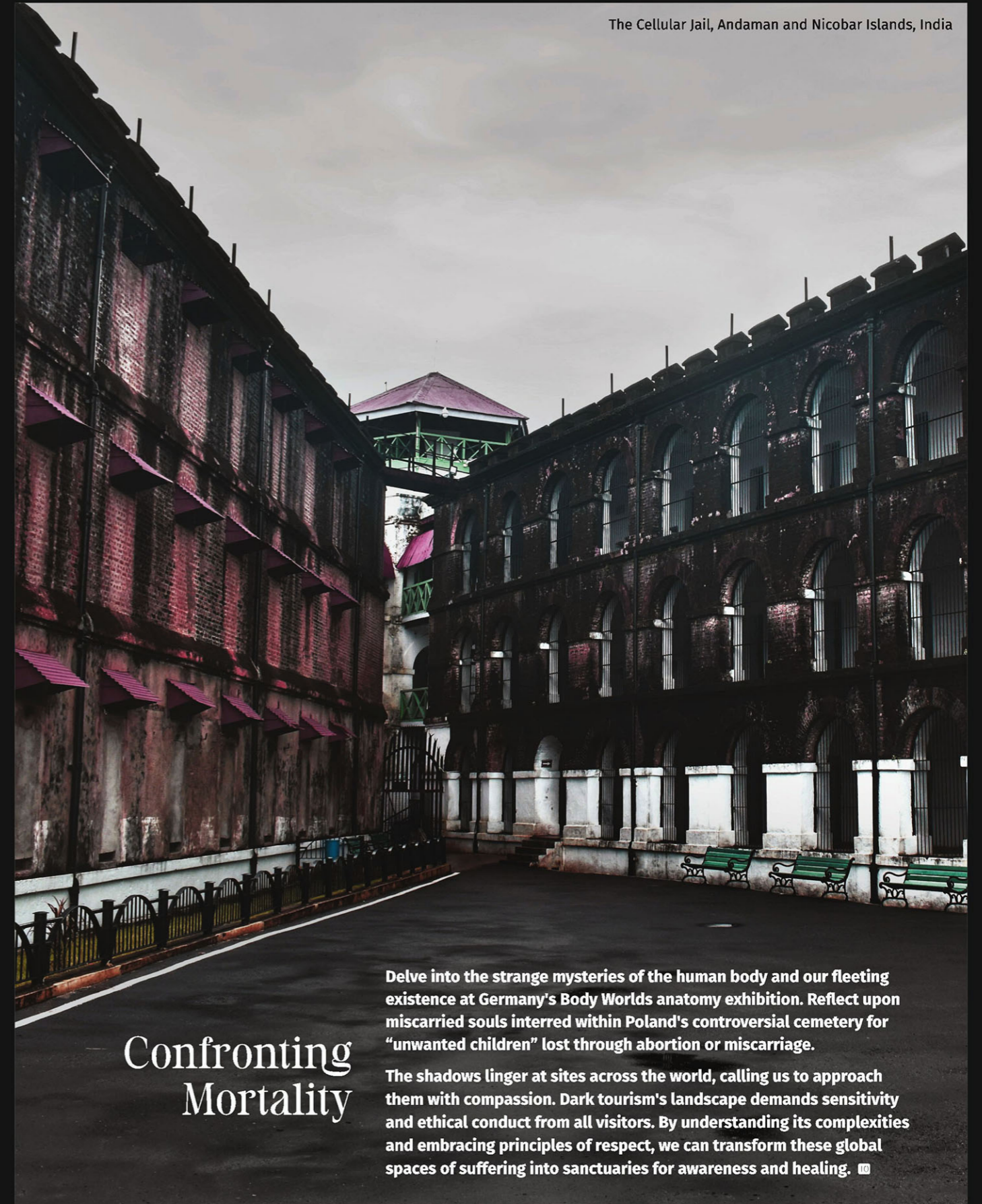
The Cellular Jail, Andaman and Nicobar Islands, India