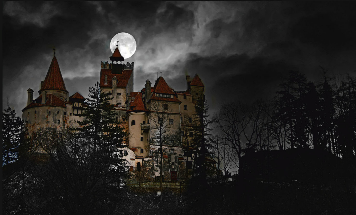
Bran Castle, Transylvania, Romania

While India offers a compelling array of dark tourism destinations, some of the world's most iconic sites of tragedy and suffering exist beyond our borders. By looking further afield, one can trace disturbing threads that tie humanity's darkest impulses across cultures and continents.