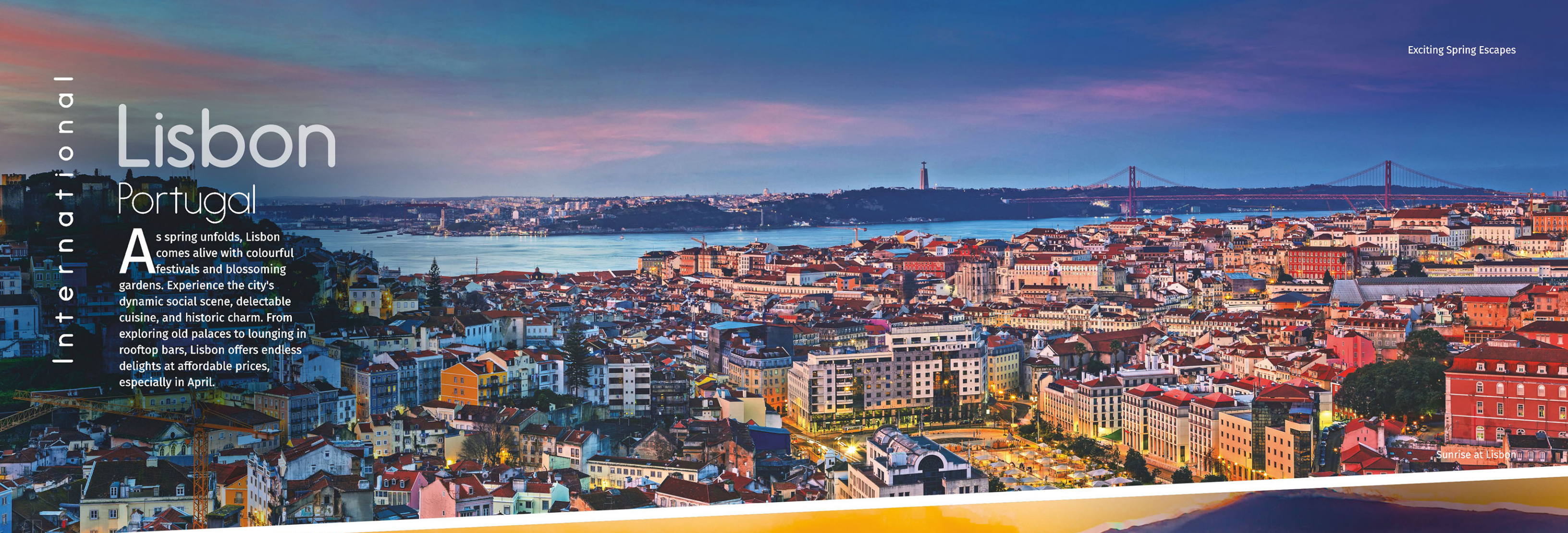
Sunrise at Lisbon

As spring unfolds, Lisbon comes alive with colourful festivals and blossoming gardens. Experience the city's dynamic social scene, delectable cuisine, and historic charm. From exploring old palaces to lounging in rooftop bars, Lisbon offers endless delights at affordable prices, especially in April.