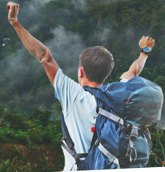
Karwani River, Garo Hills, Meghalaya

Spring transforms Shillong with cherry blossoms, creating a picturesque landscape. While spring is ideal, the pleasant weather makes it a year-round destination. Explore the beauty of Shillong and Garo Hills through various sightseeing options, ensuring a memorable vacation.