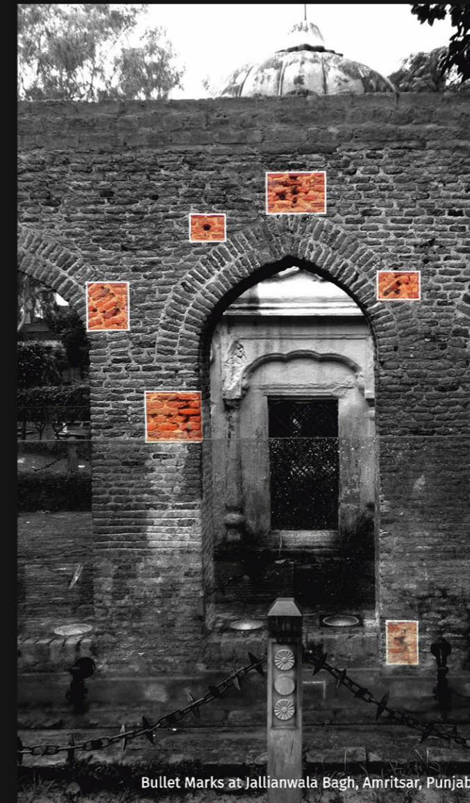
Bullet Marks at Jallianwala Bagh, Amritsar, Punjab

Imagine standing amongst the bullet marks at Jallianwala Bagh, feeling the weight of history pressing down. Or contemplating the sombre silence of the Cellular Jail, haunted by echoes of struggle. This captures the essence of an emerging phenomenon in tourism – what is termed “dark tourism.” It sees travellers venture beyond typical sights to places associated with death, suffering, and the disturbing sides of humanity.