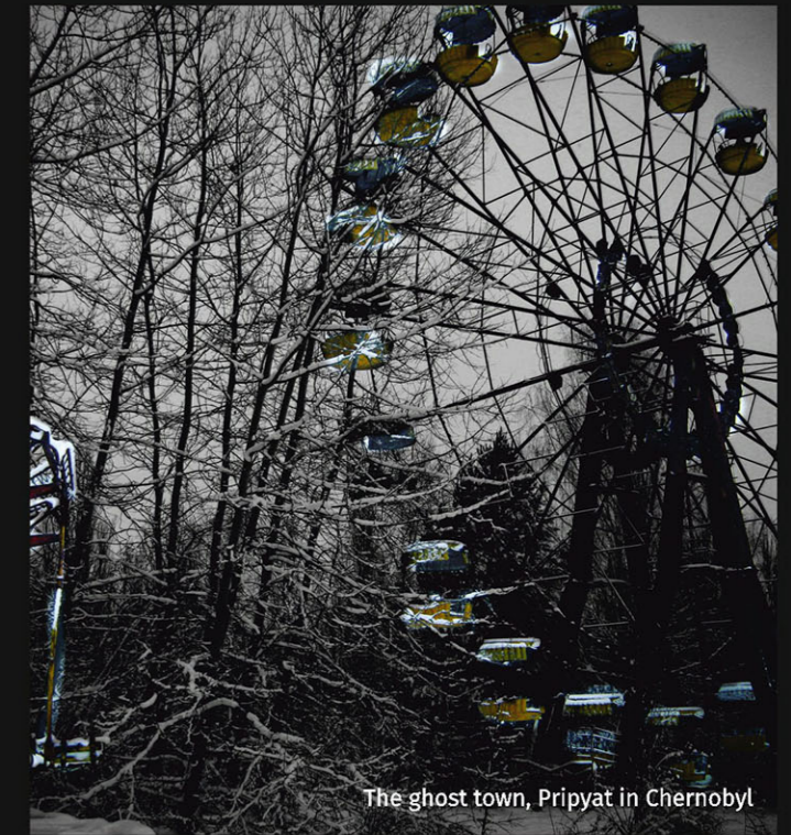
The ghost town, Pripyat in Chernobyl