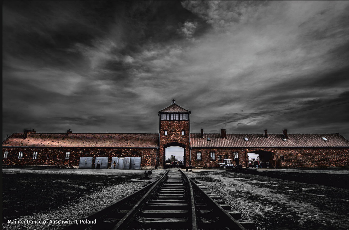
Main entrance of Auschwitz II, Poland

Despite the seemingly grim themes, dark tourism enjoys rising popularity. Several factors contribute to this curious phenomenon: